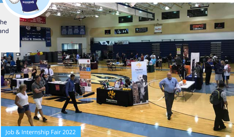
Job & Internship Fair 2022