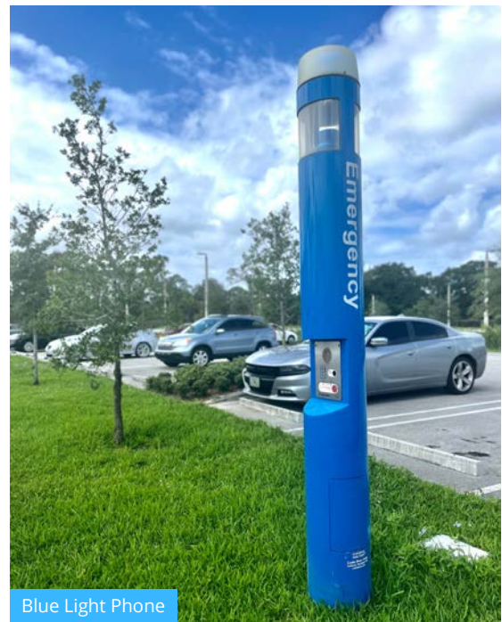
Blue Light Phone