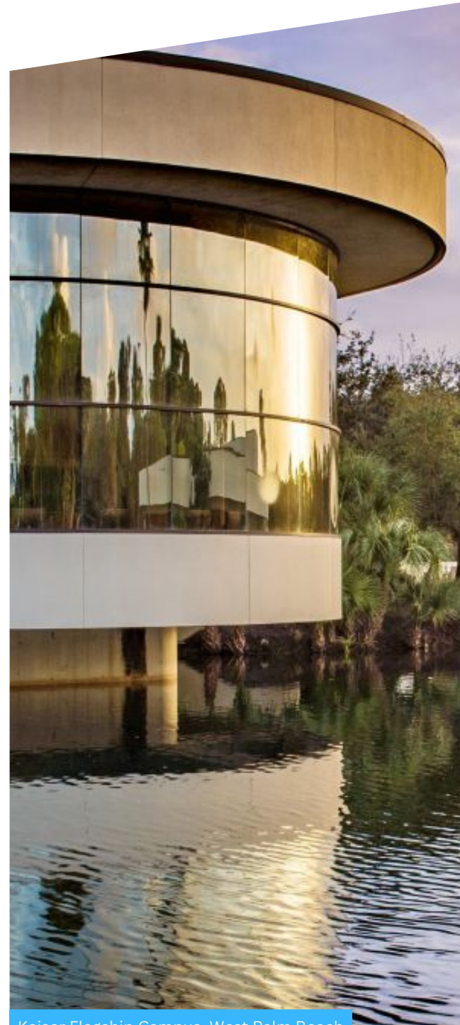
Keiser Flagship Campus, West Palm Beach