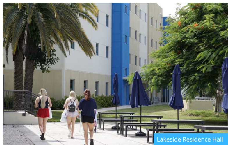
Lakeside Residence Hall

Visit the Keiser University dining website for more information at https://keiseruniversity.sodexomyway.com/my-meal-plan/index