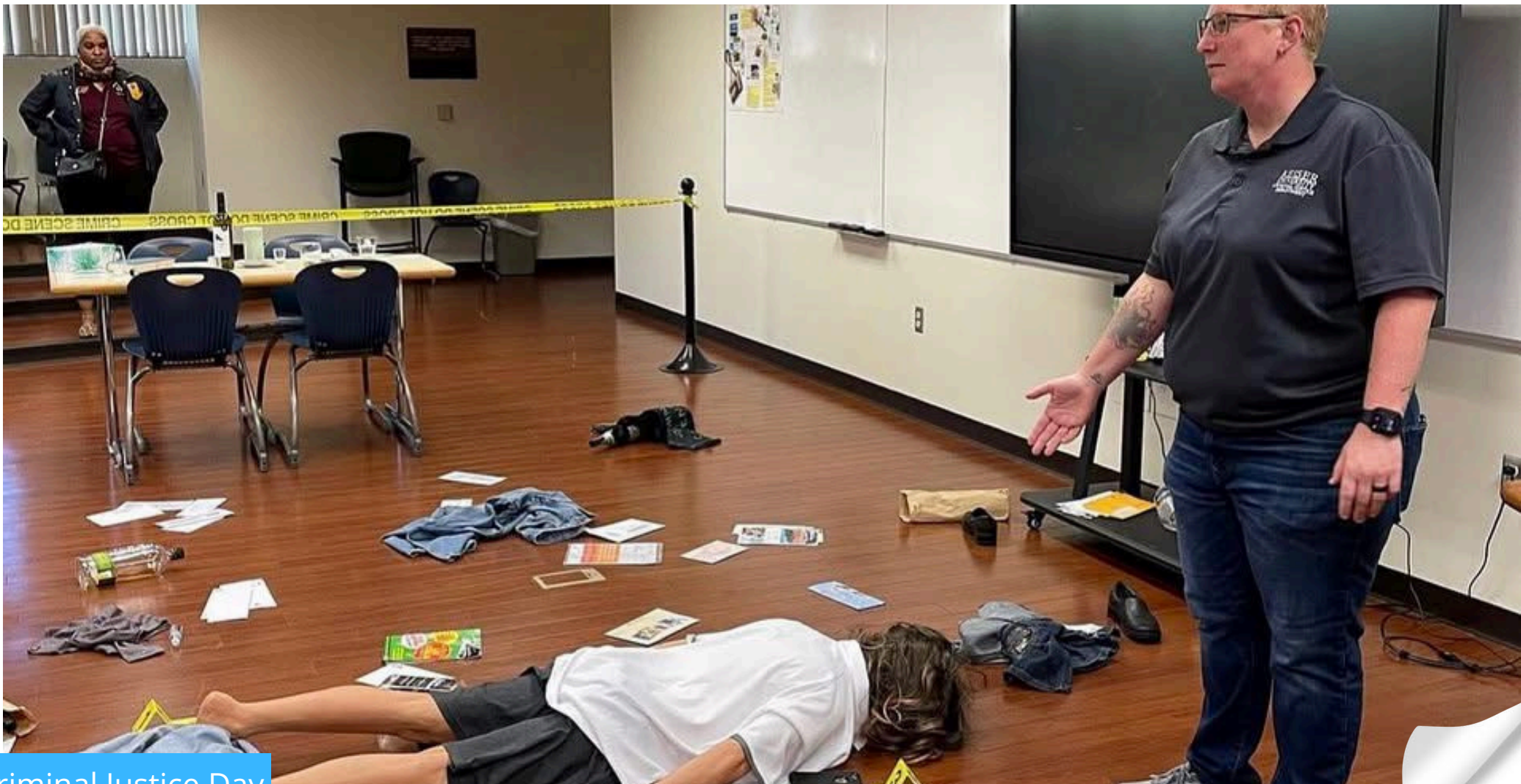
Criminal Justice Day

1301 Belvedere Road West Palm Beach, FL 33405 561-833-9218 ihg.com