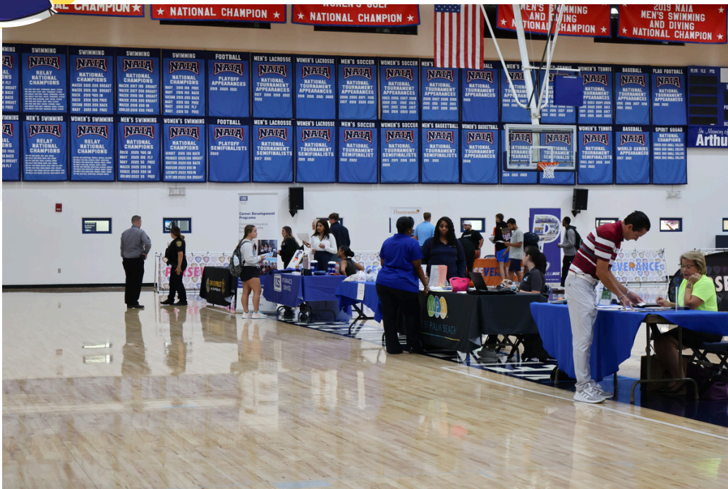
Job & Internship Fair