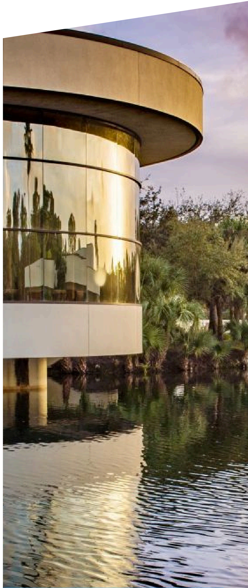
Keiser Flagship Campus, West Palm Beach