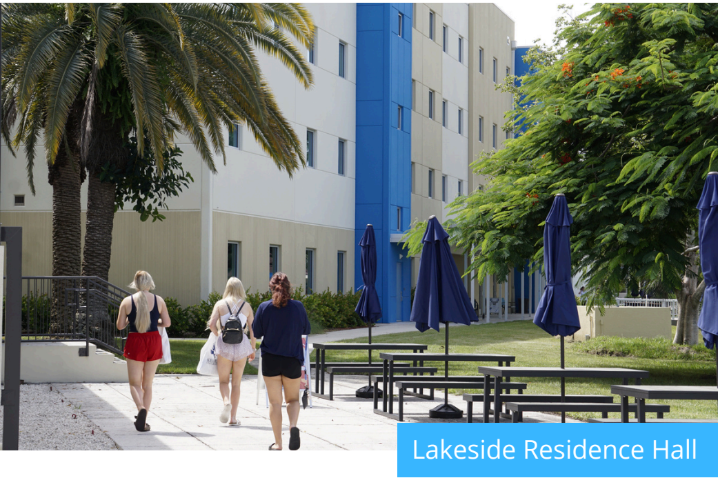
Lakeside Residence Hall